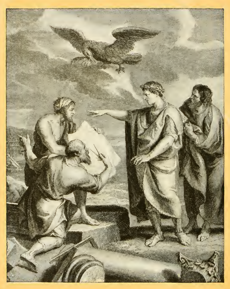
FROM PAINTING BY RUBENS