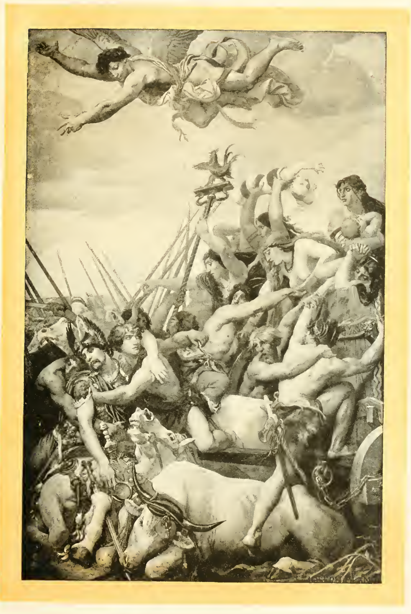
THE BATTLE OF TOLBIAC Vol. 11, pp. 658-672